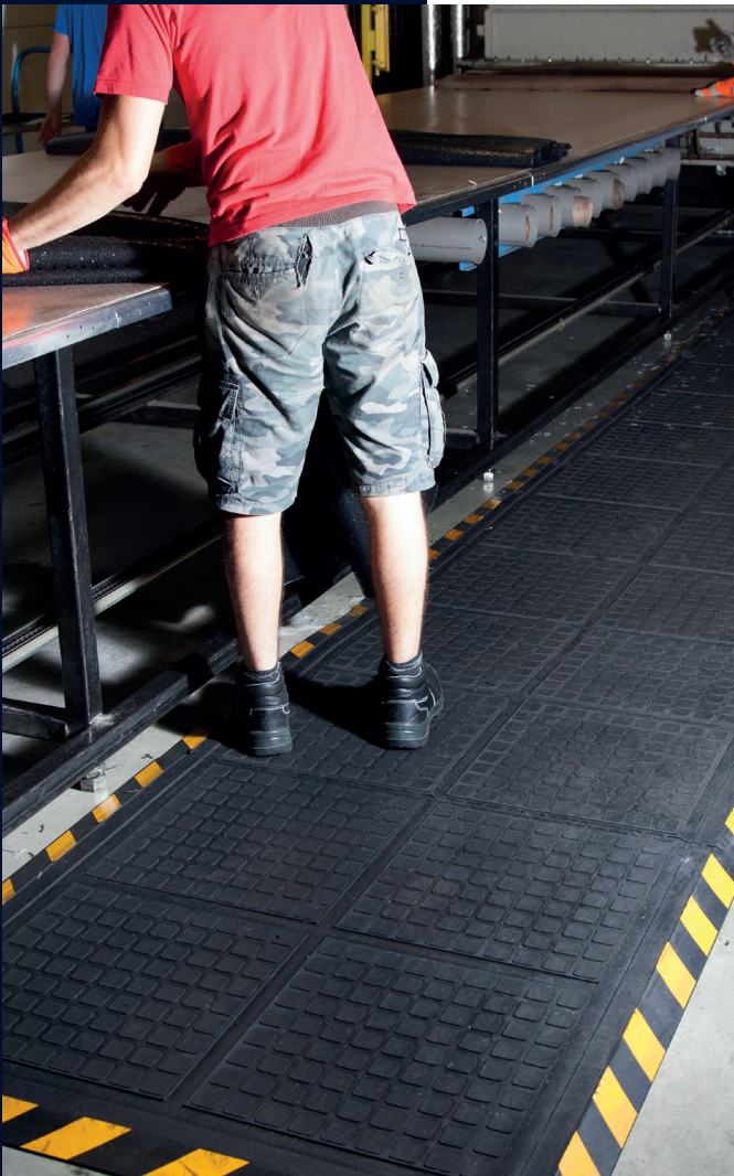
Standard Sizes (cm)