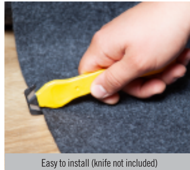
Easy to install (knife not included)