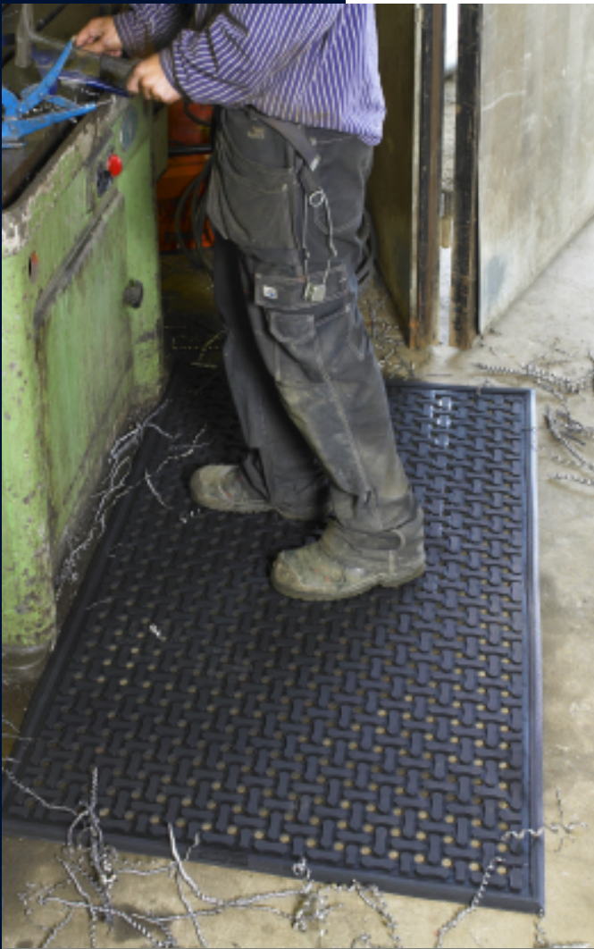
Standard Sizes (cm)