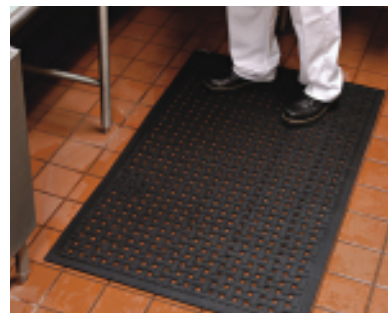
Ideal for wet applications