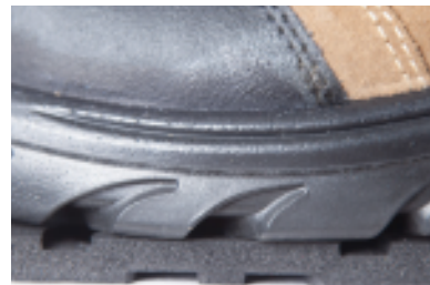
Thickness 0.95 mm